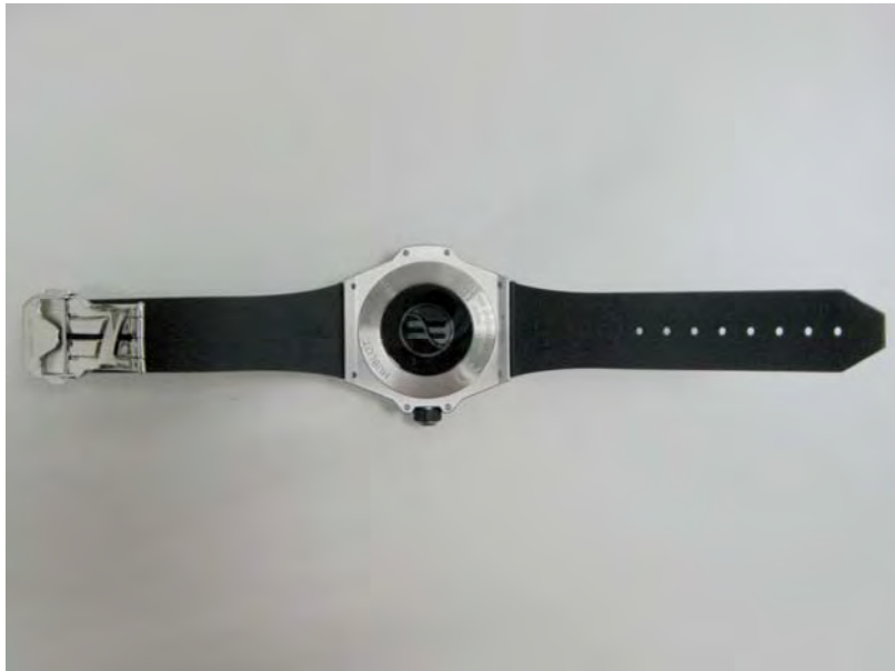
Fig.6 Back view of EUT

Unless otherwise stated the results shown in this test report refer only to the sample(s) tested and such sample(s) are retained for 90 days only. 除非另有說明，此報告結果僅對測試之樣品負責，同時此樣品僅保留90天。本報告未經本公司書面許可，不可部份複製。