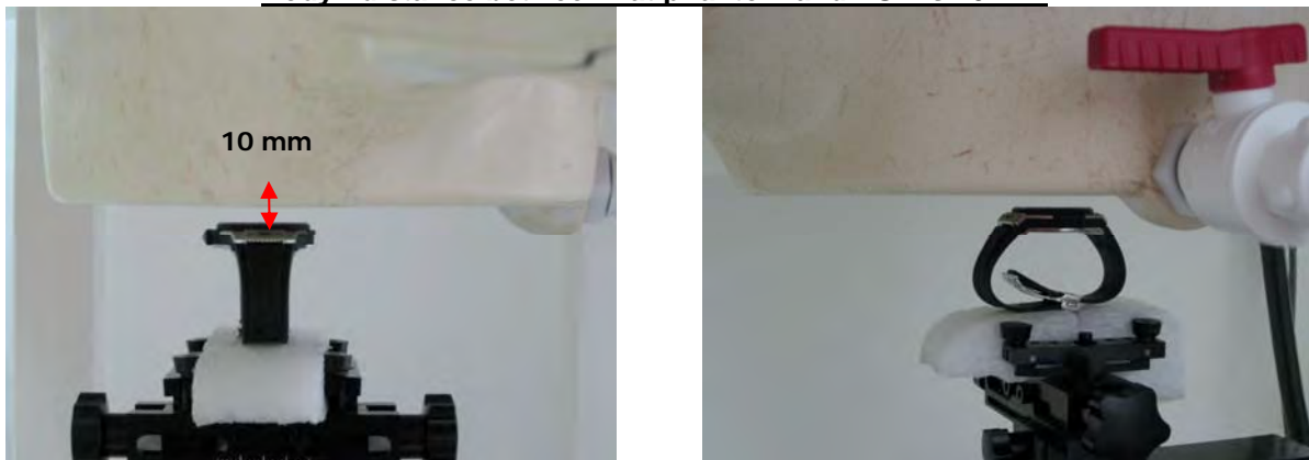
Fig.4 Front side of EUT to flat phantom

Unless otherwise stated the results shown in this test report refer only to the sample(s) tested and such sample(s) are retained for 90 days only.