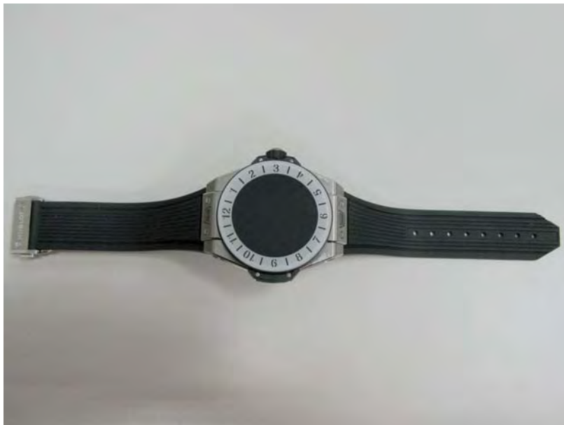
Fig.5 Front view of EUT