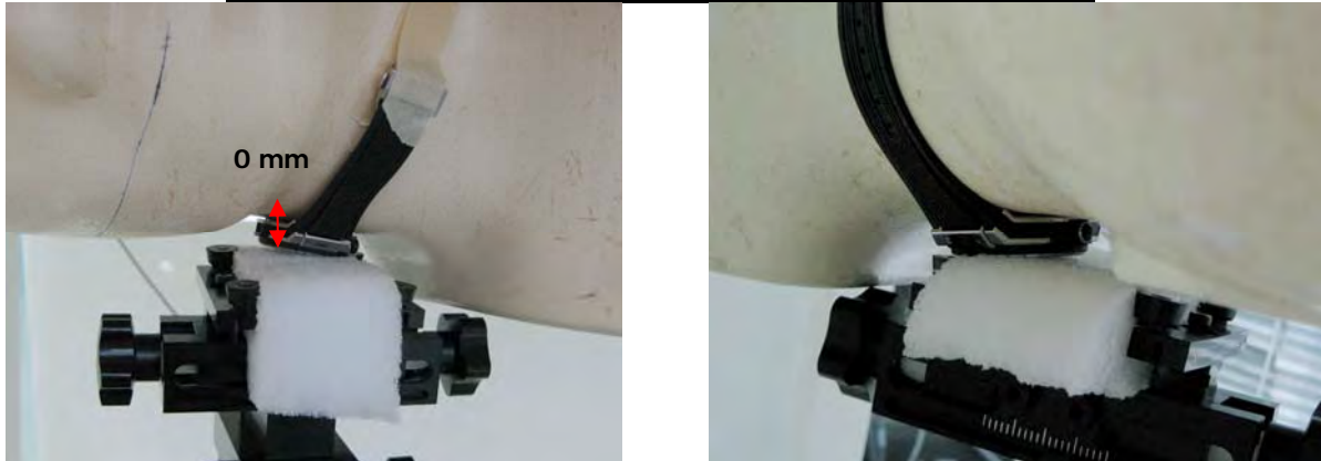
Fig.3 Back side of EUT to flat phantom