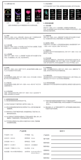
M10英文说明书, 105g铜版纸, 四色印刷, 风琴折, 5折页, 尺寸:142*280