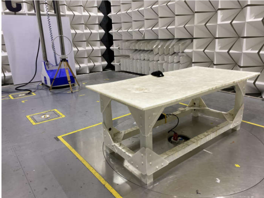
Radiated spurious emission Test Setup-1(Below 30MHz)