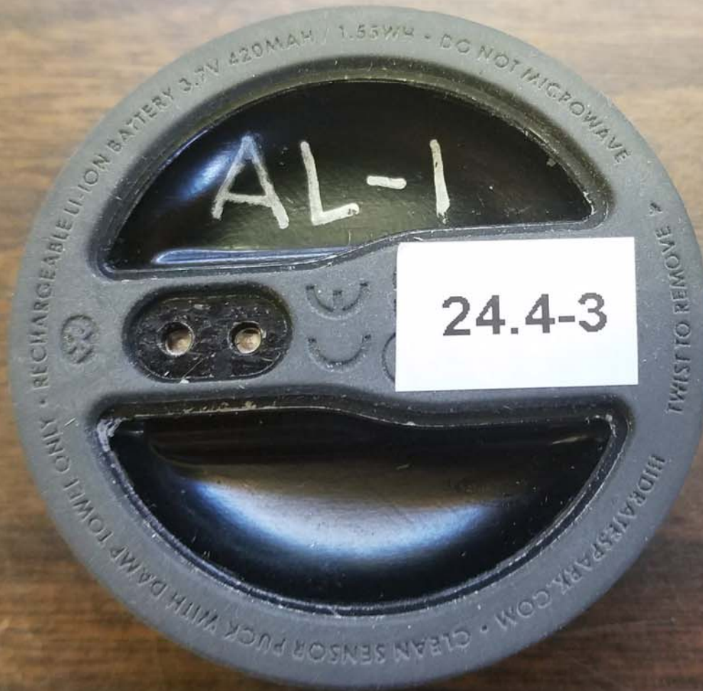
Top View of the Aluminum Enclosure - This is the top part of the EUT and was taken to show the difference between this and the plastic enclosure.