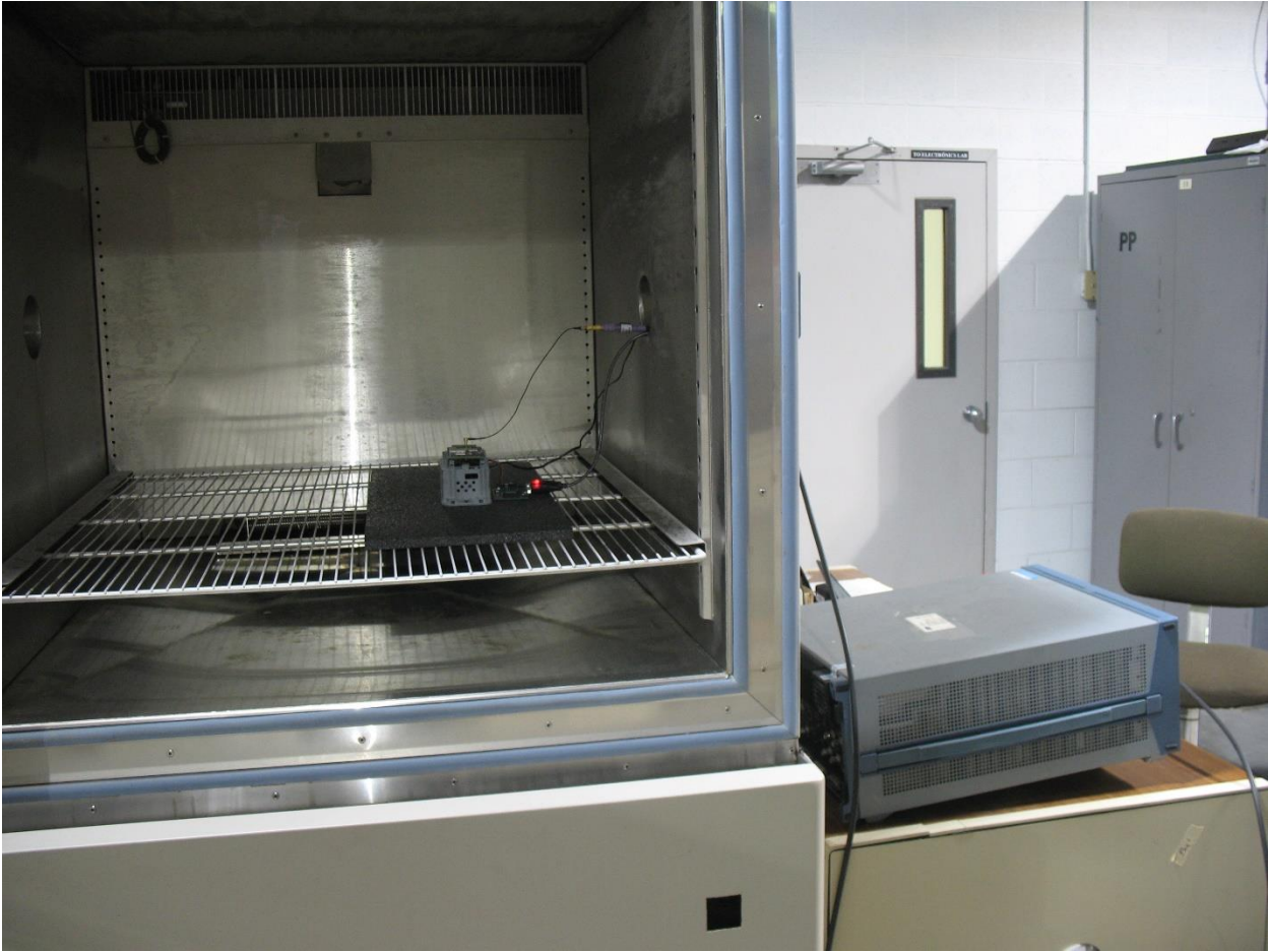
Frequency Stability to temperature changes