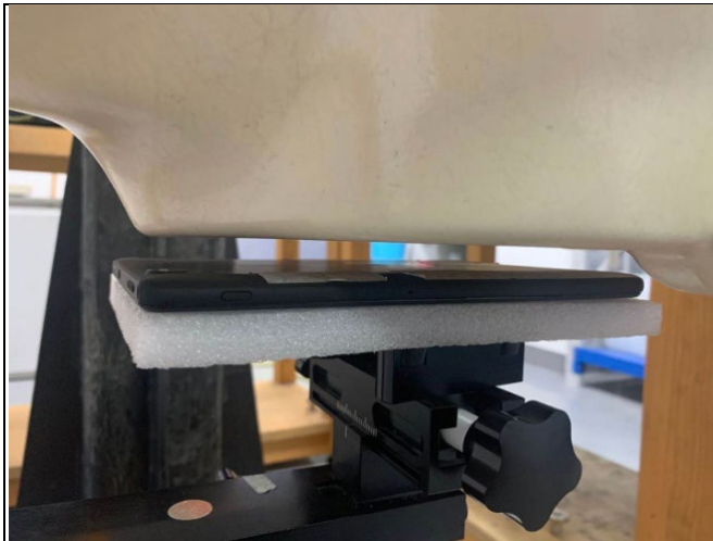
Rear Face of EUT with 1.1 cm Gap