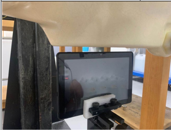
Top Side of EUT with 1.1cm Gap