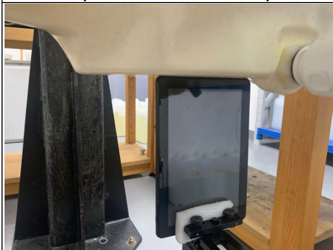
Right Side of EUT with 0cm Gap