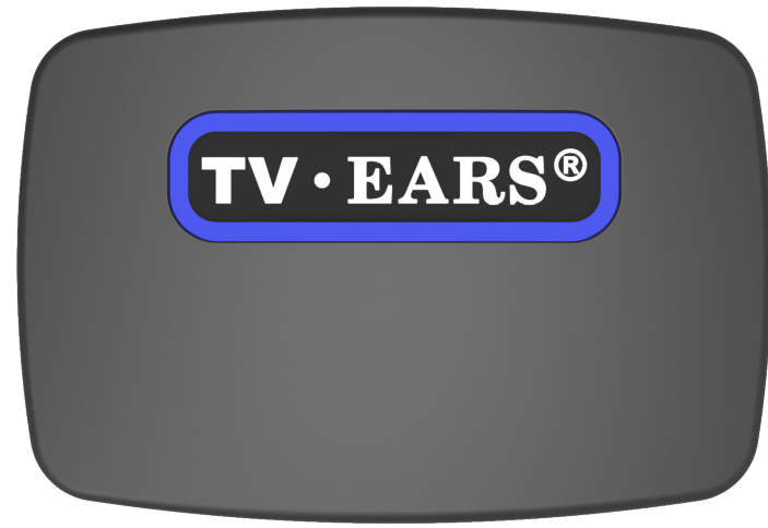
MINI TV TRANSMITTER TOP VIEW

The TV transmitter is set up with Near Field Technology which will allow it to work seamlessly as soon as both the Transmitter and Speaker are turned on and there's an Audio connection between the transmitter and the TV.