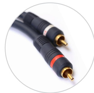
COAXIAL TO COAXIAL