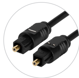
OPTICAL TO OPTICAL CORD

"POWER" | "OPTICAL" | "COAXIAL" | "ANALOG" PORTS