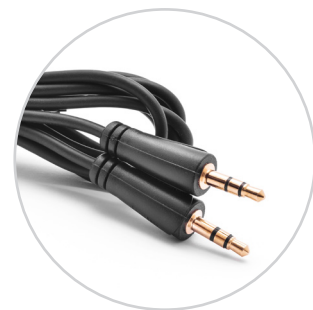
3.5MM TO 3.5MM CORD