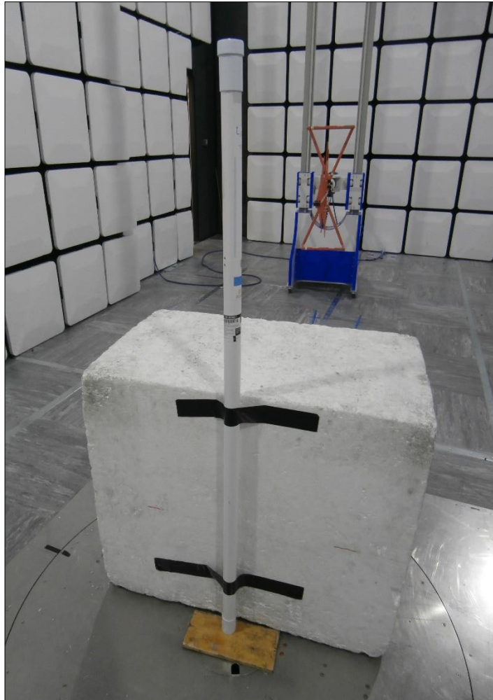
Figure 1 - Test Setup - 30 MHz to 1 GHz