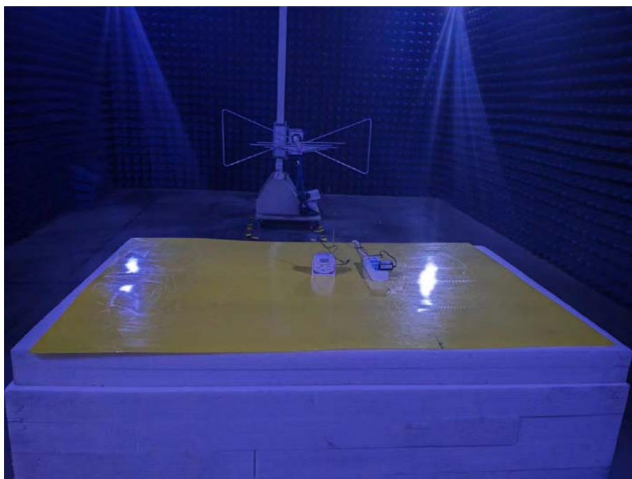
Photo of Radiated Emission Measurement Above 1GHz