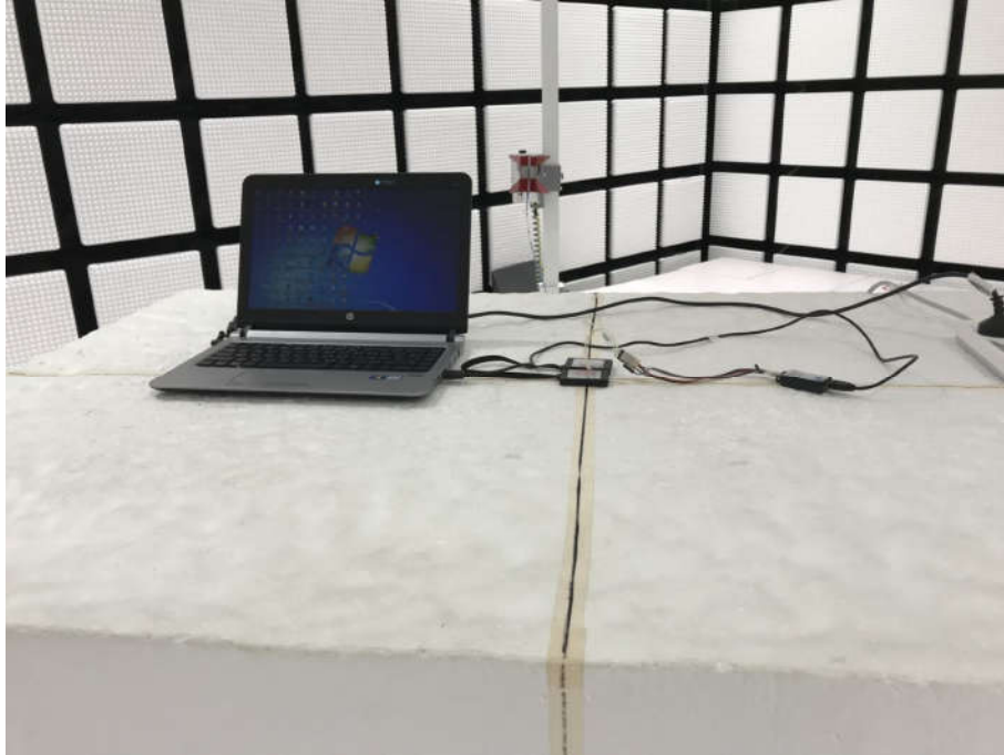
Radiated spurious emission Test Setup-3 (Above 1GHz)