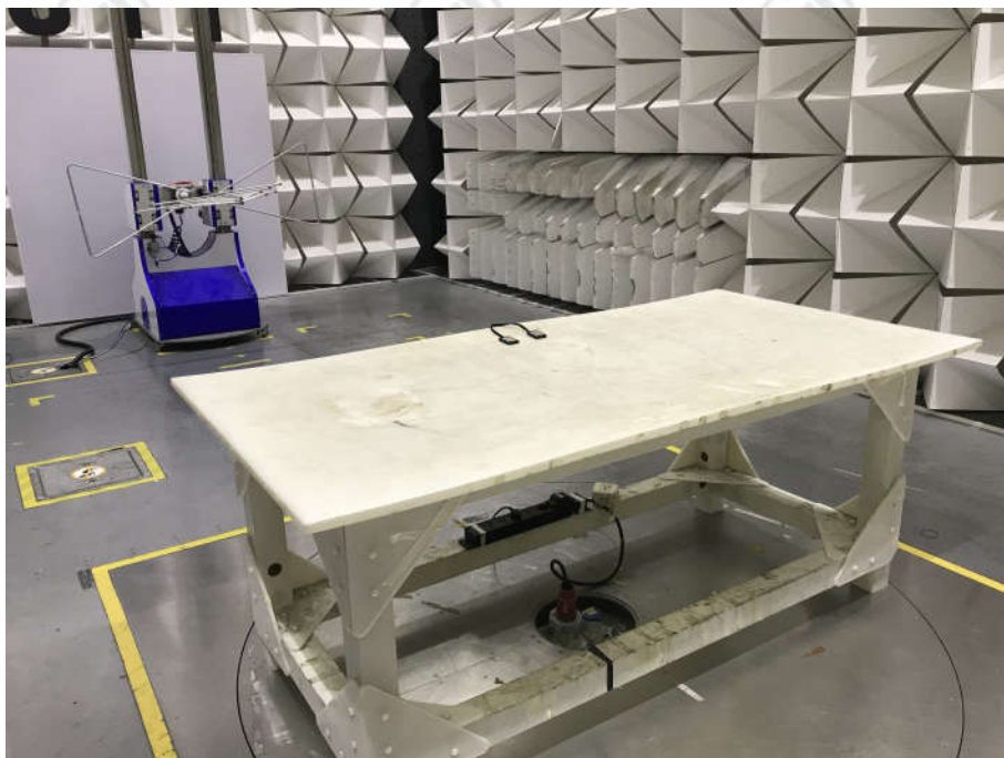
Radiated spurious emission Test Setup-1 (Below 1GHz)