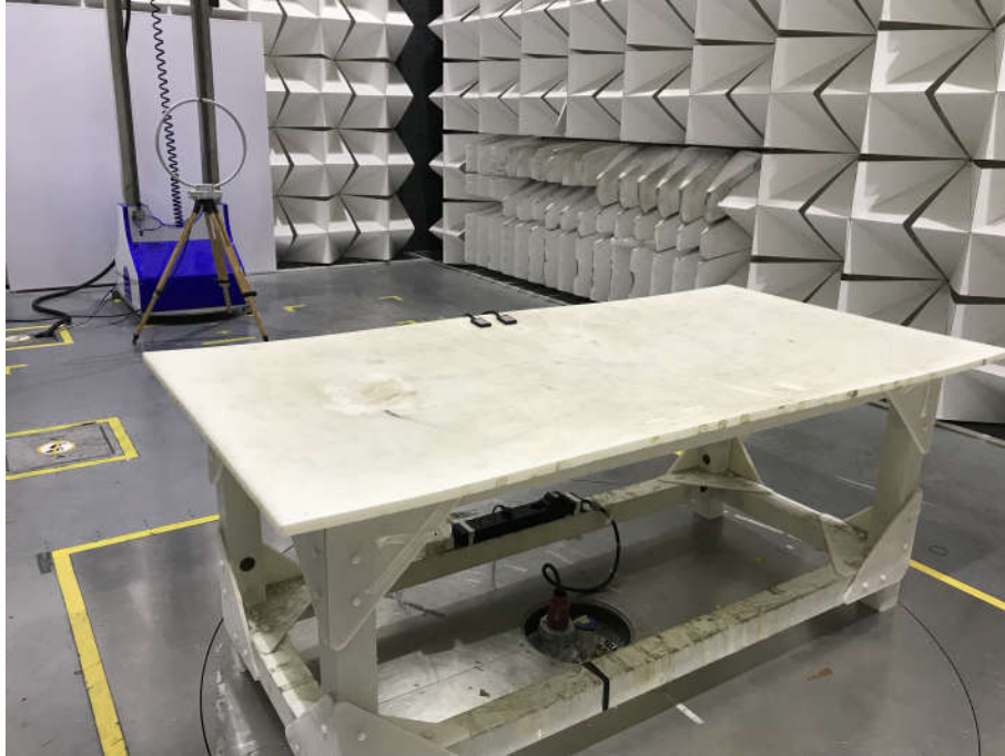
Radiated spurious emission Test Setup-2 (Below 30M)