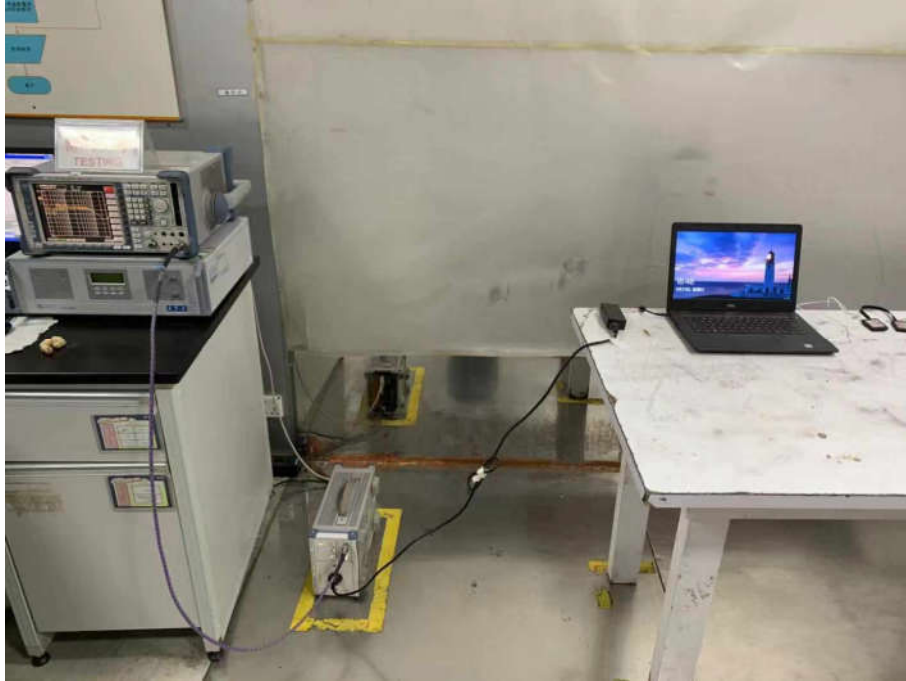
AC Conducted Emissions Test Setup