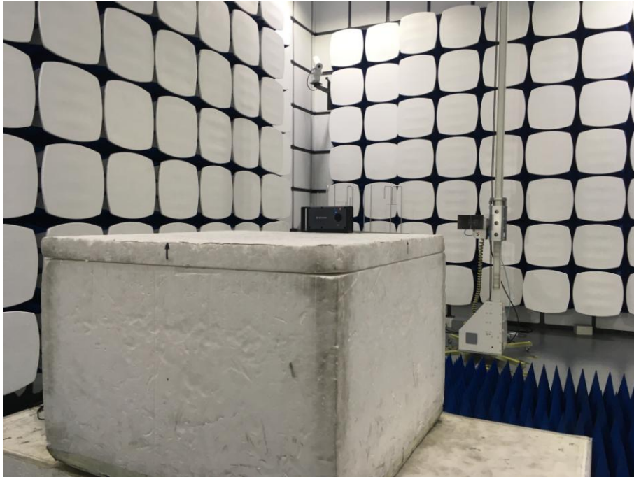
Photos of Radiated emission