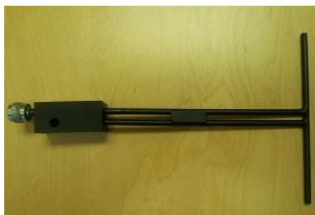
Figure 1 – MVG COMOSAR Validation Dipole

MVG’s COMOSAR Validation Dipoles are built in accordance to the IEC/IEEE 62209-1528 and FCC KDB865664 D01 standards. The product is designed for use with the COMOSAR test bench only.