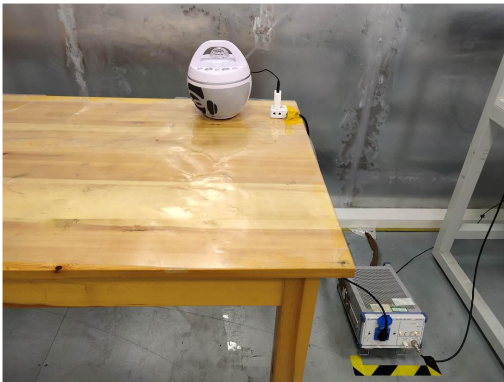
AC Conducted Emission of charge from power adapter mode