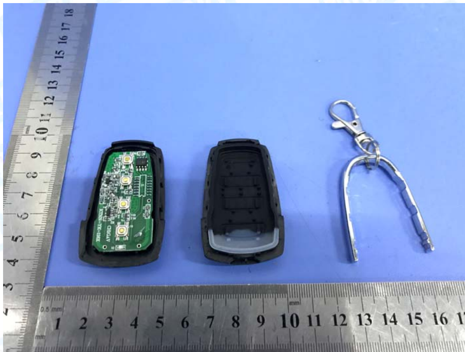
Photo 8 Appearance of PCB