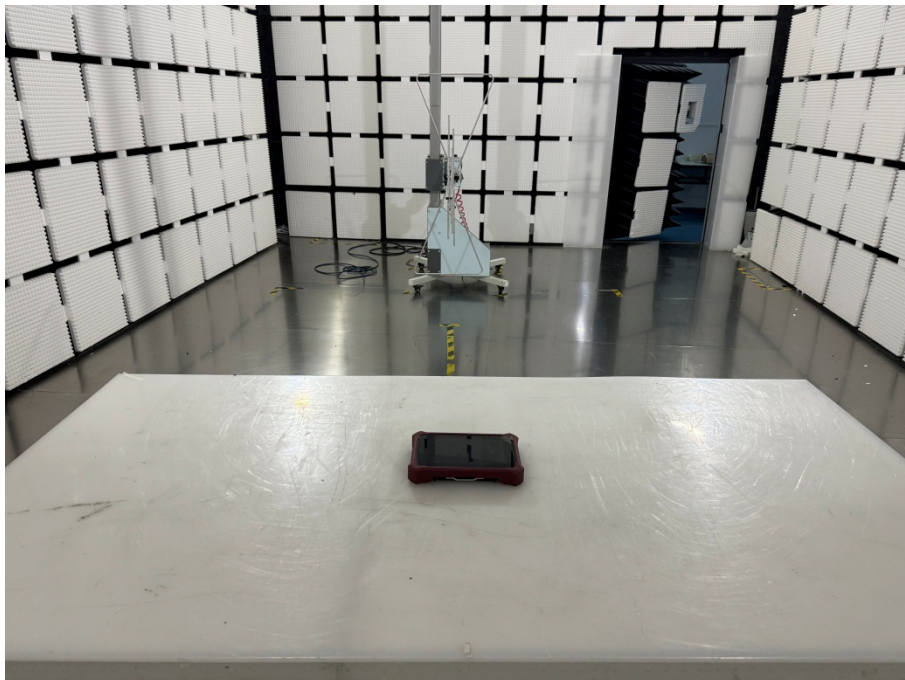
30MHz - 1GHz