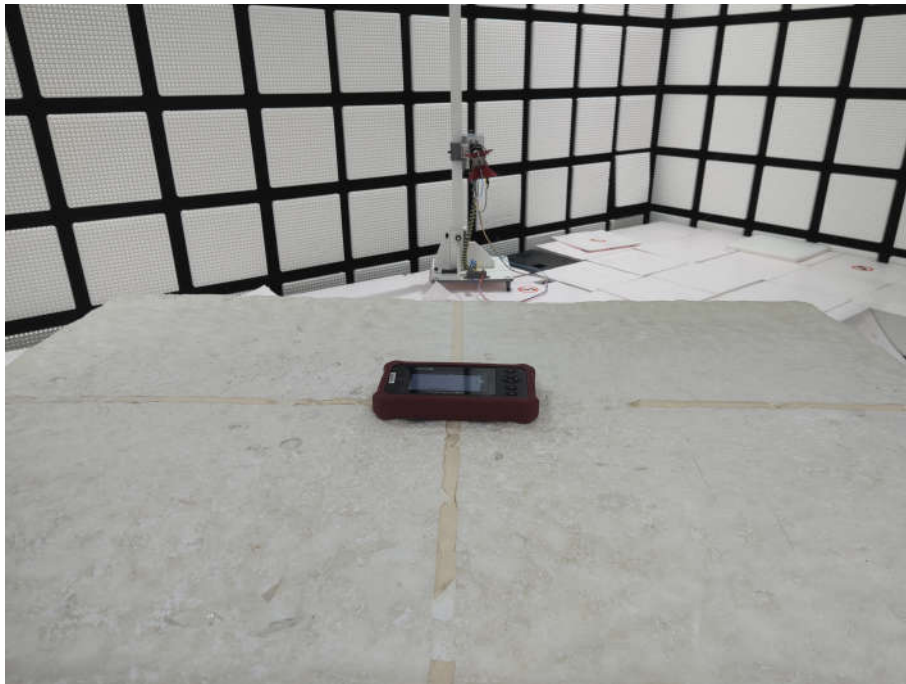
Radiated spurious emission Test Setup-2(1-18GHz)