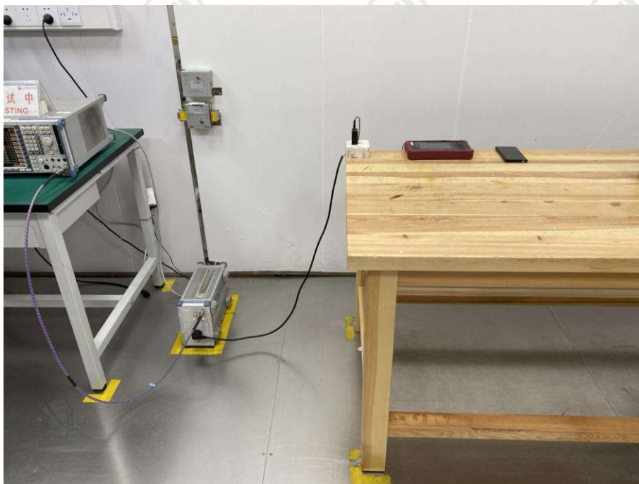
Conducted emission Test Setup