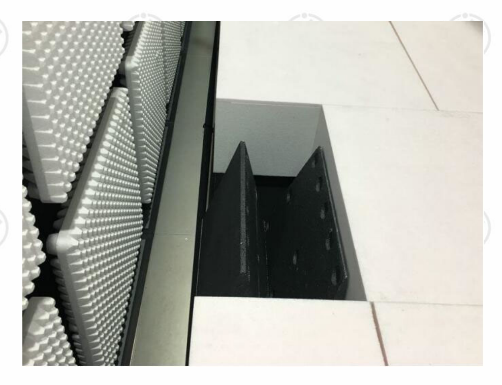
Radiated spurious emission Test Setup-3(Above 1GHz) There are absorbing materials under the ground.