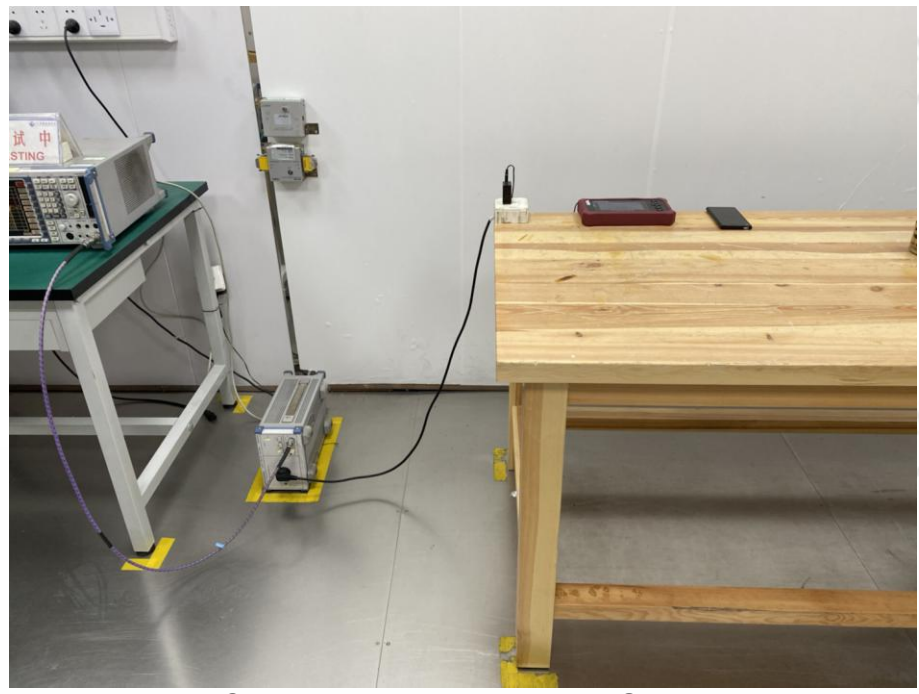
Conducted emission Test Setup