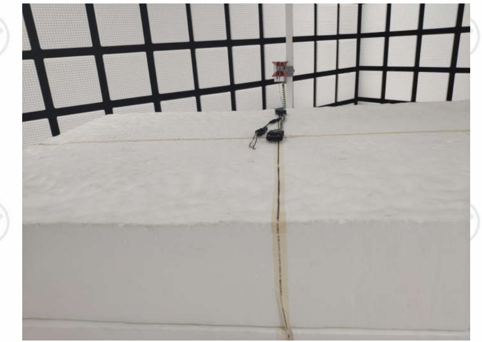
Radiated spurious emission Test Setup-3(Above 1GHz)