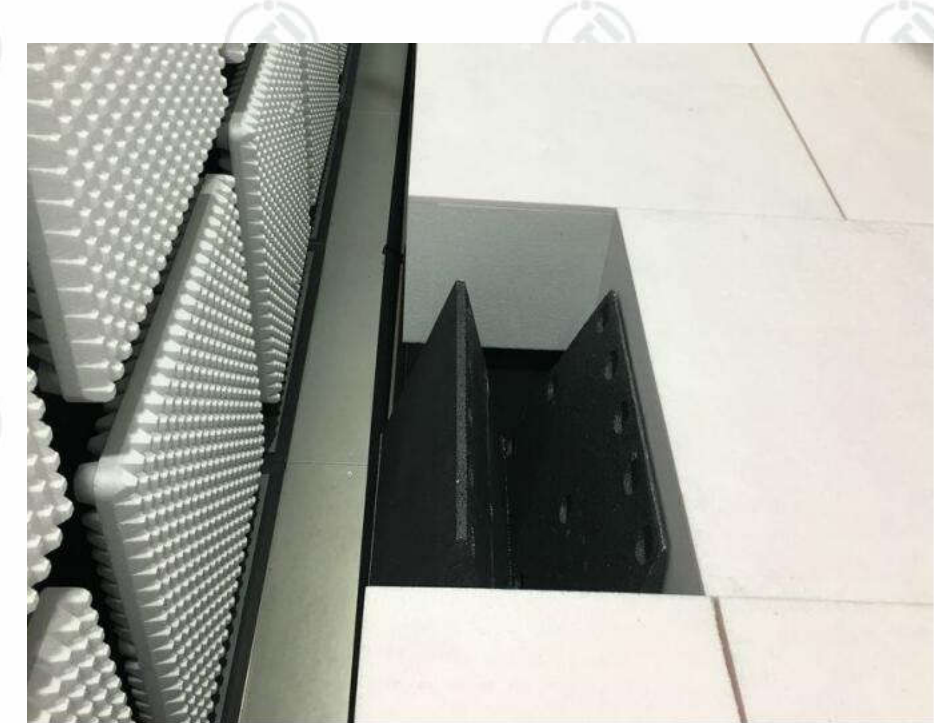
Radiated spurious emission Test Setup-4(Above 1GHz) There are absorbing materials under the ground.