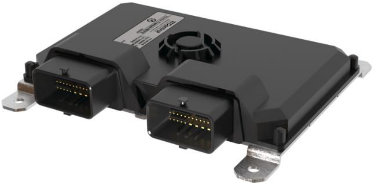
Figure 1: Product

Device that the certification is applied for: