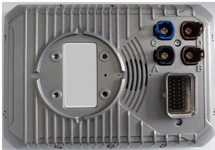
Figure 2: Label Location

The product label is fitted on the bottom side of the device, see the following reference picture: