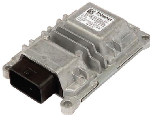
Figure 1: Product TTC 2030

Device that the certification is applied for: