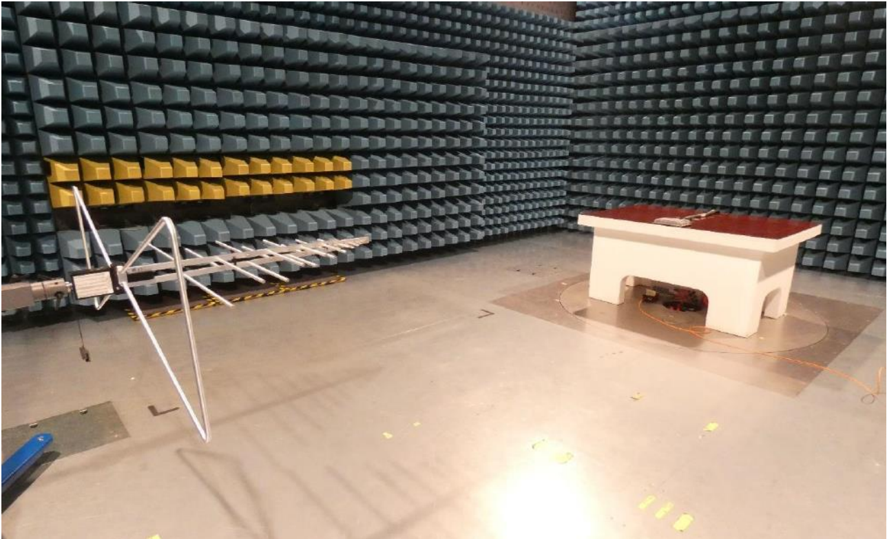
Figure 2: Radiated Emission 30 MHz – 1000 MHz