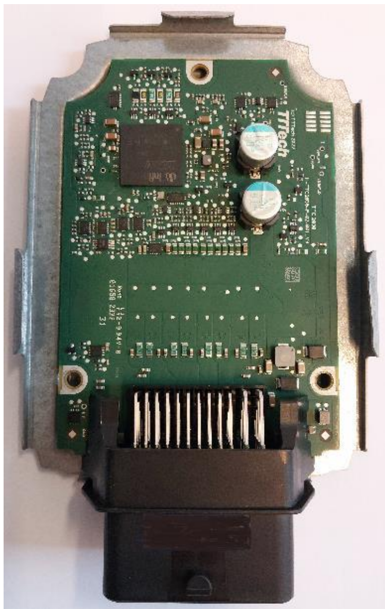
Figure 2: Top view internal