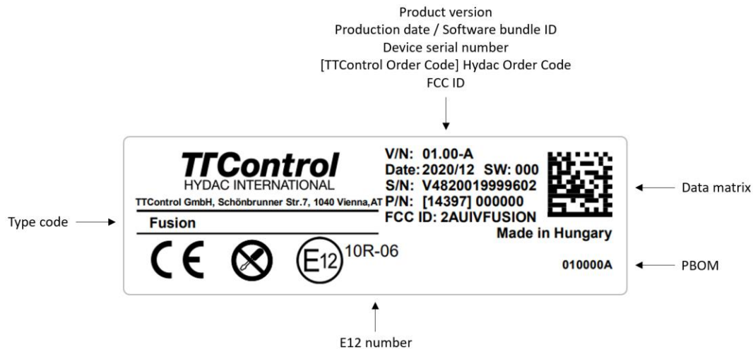
Figure 1: Label Design

The following design artwork is used for the product label: