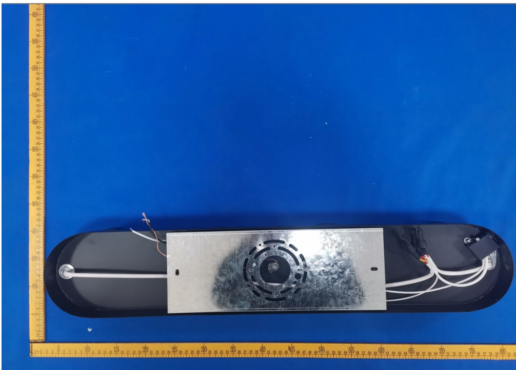
Fig.2 (Model: VAN-SACT)