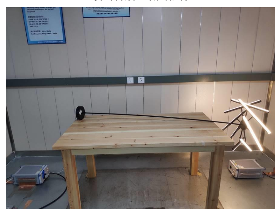
Radiated Disturbance below 1GHz