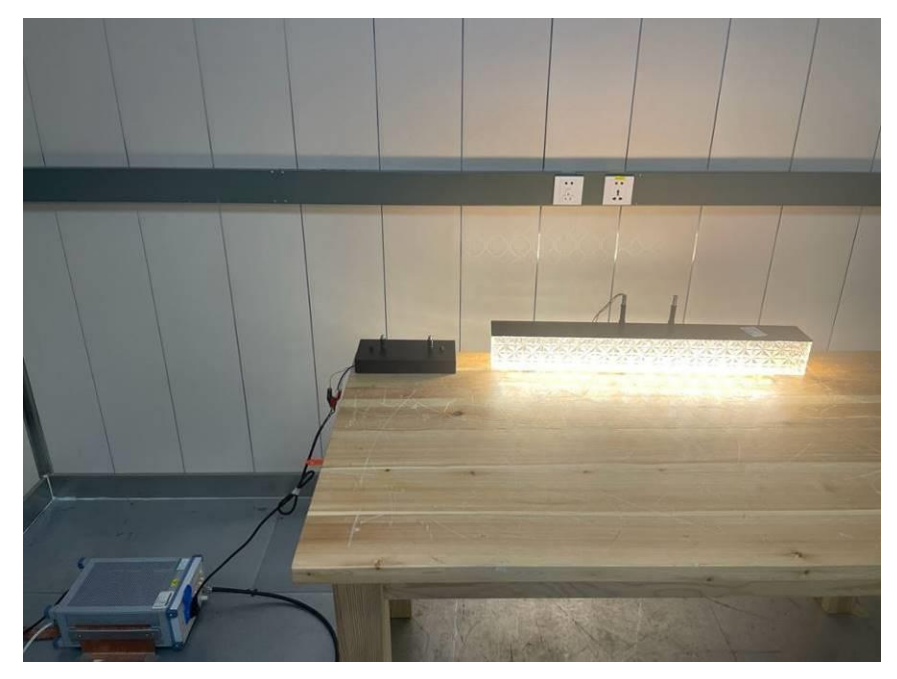
Radiated Disturbance below 1GHz