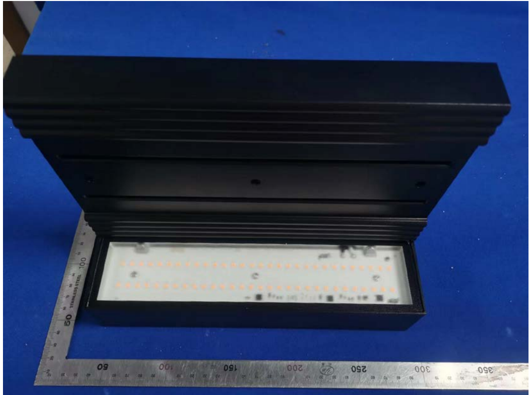
FIGURE 4 LED LUMINAIRE (M/N: OUT-HA-MB) REMOVE COVER