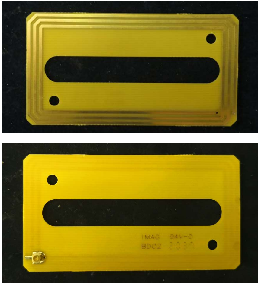
Figure 9.9 LF Antenna