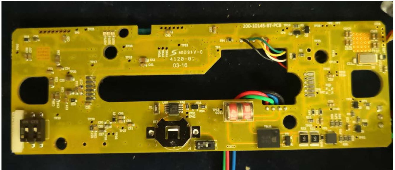
Figure 9.8 PCB Back Side View