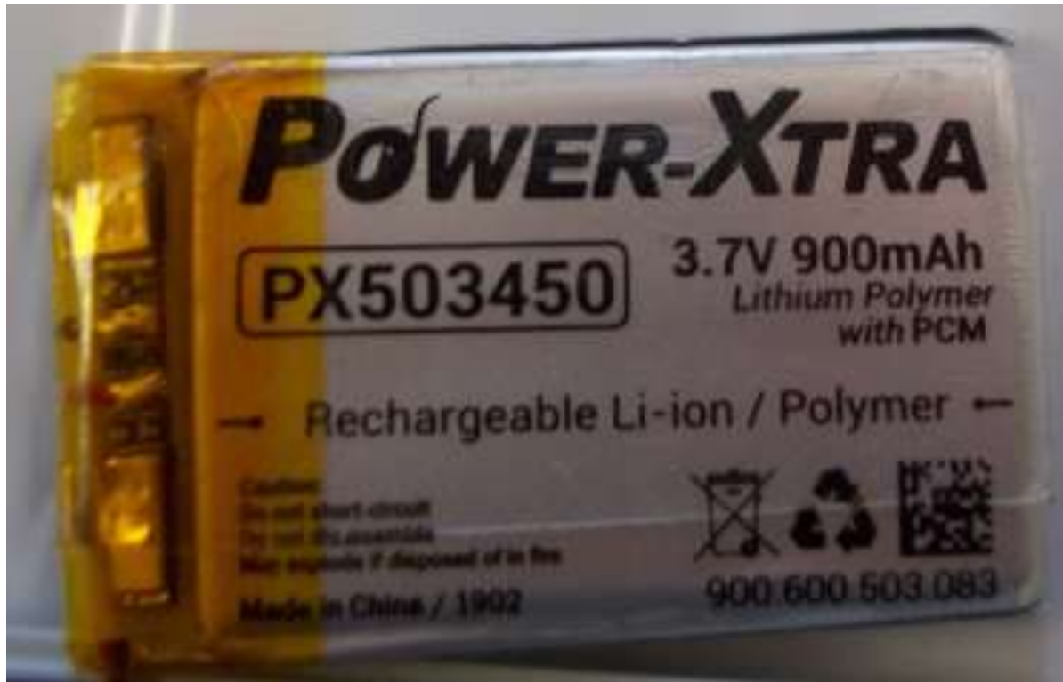
Figure 6. Seated Battery Pack

FCC Part 15 Certification 2AUF1-MT-02BDC-IP 19-0289 October 23, 2019 OKYANUS TEKNOLOJİ BILGISAYAR VE YAZILIM SAN. TIC. MT-02BDC-IP