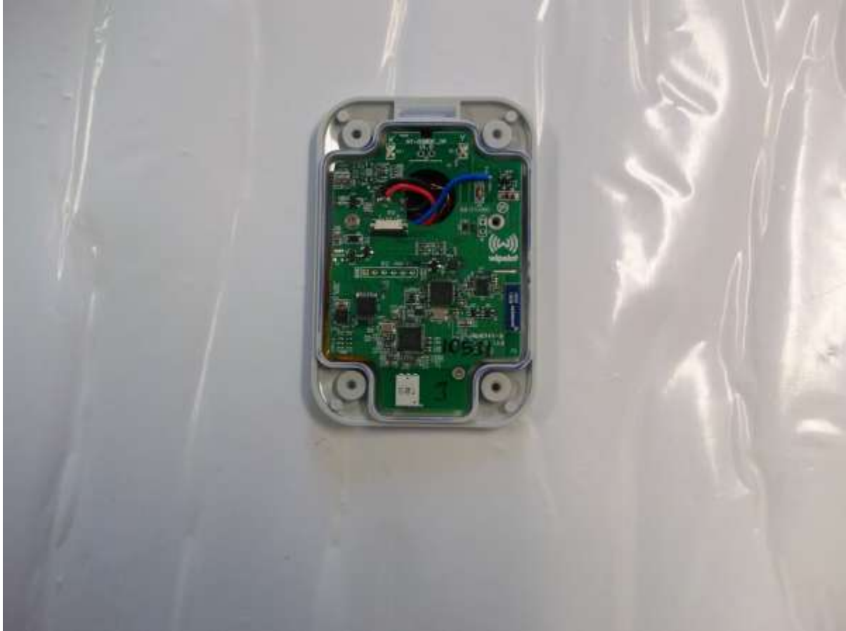
Figure 2. Top of PCB

FCC Part 15 Certification 2AUF1-MT-02BDC-IP 19-0289 October 23, 2019 OKYANUS TEKNOLOJI BILGISAYAR VE YAZILIM SAN. TIC. MT-02BDC-IP