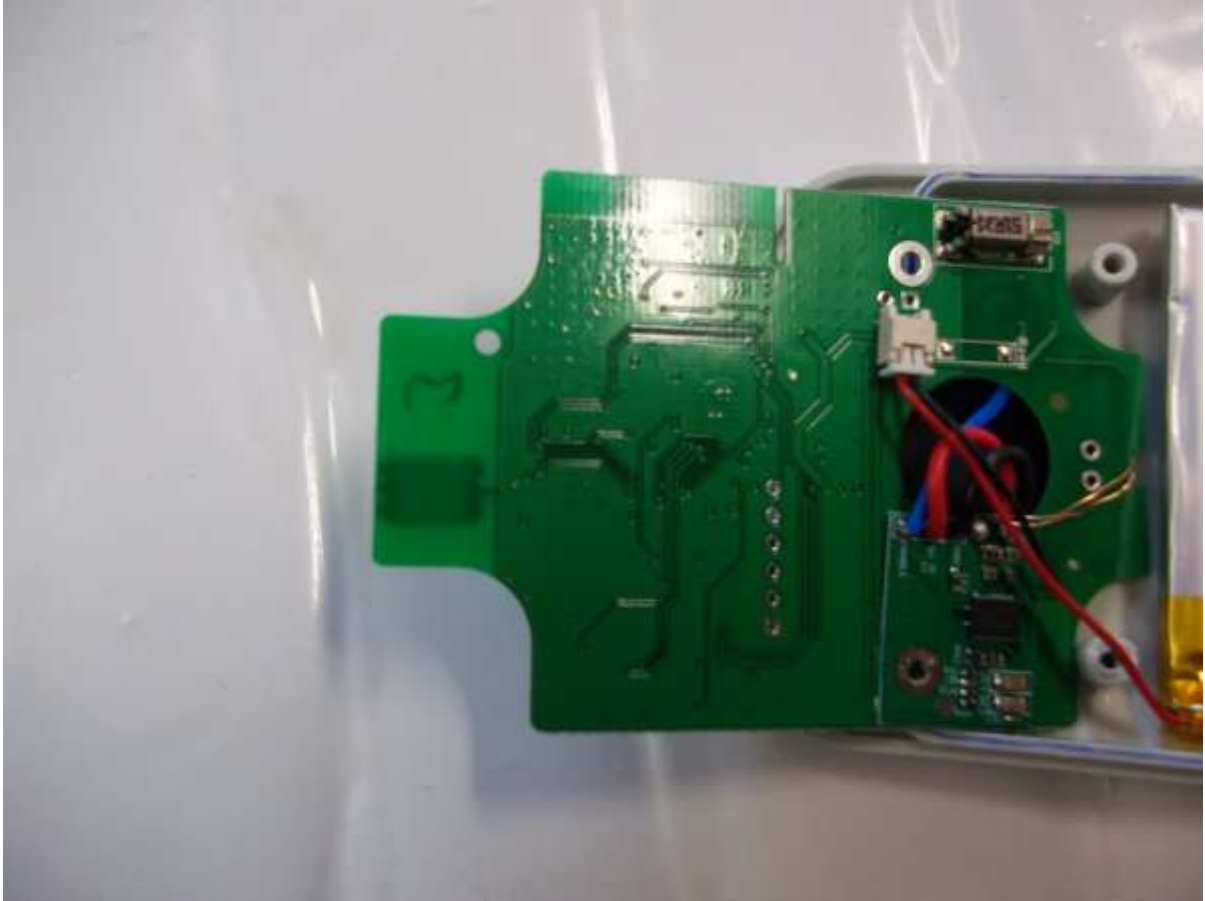
Figure 3. PCB, Bottom View

FCC Part 15 Certification 2AUF1-MT-02BDC-IP 19-0289 October 23, 2019 OKYANUS TEKNOLOJI BILGISAYAR VE YAZILIM SAN. TIC. MT-02BDC-IP