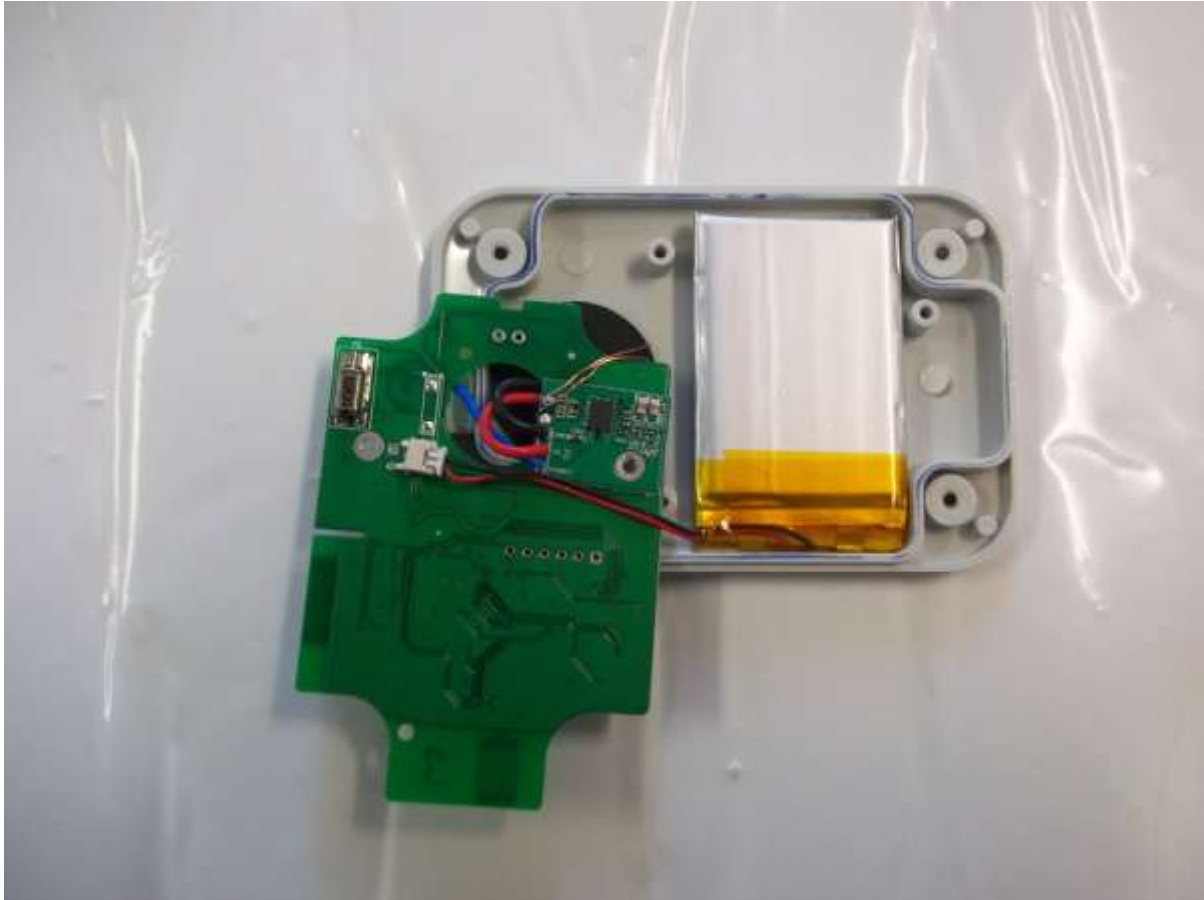
Figure 1. EUT, Inside Enclosure