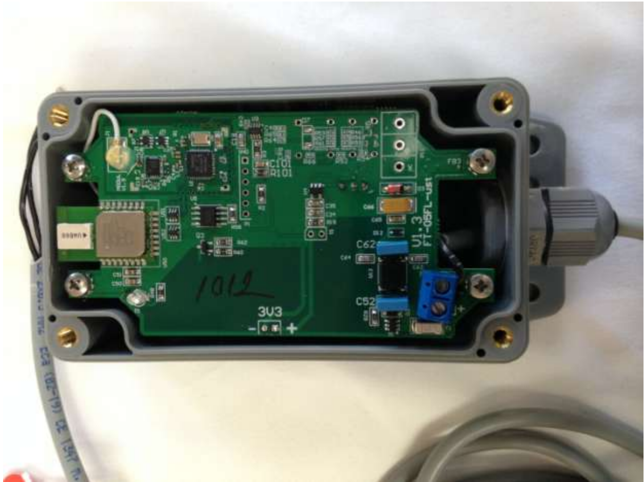
Figure 1. Top Cover Removed (Main PCB)