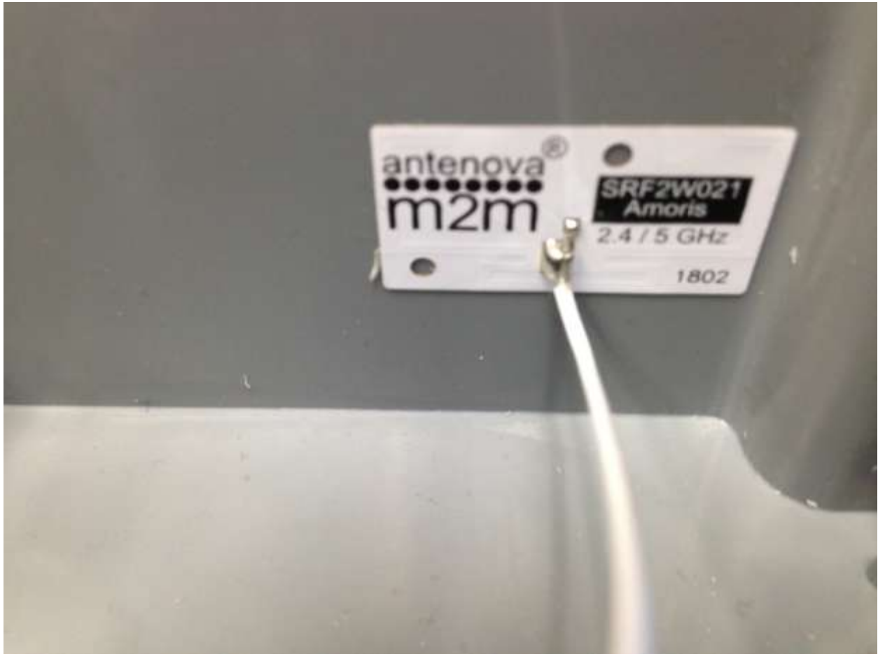
Figure 5. Flex Patch 2.4 GHz Antenna (5 GHz Band not used with this Radio)

FCC Part 15 Certification 2AUF1-FT-05FL 19-0287 November 5, 2019 OKYANUS TEKNOLOJI FT-05FL