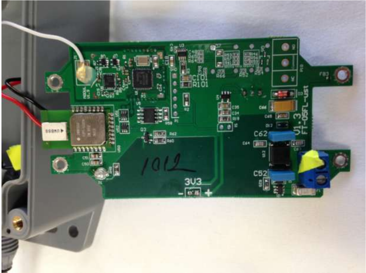
Figure 2. Main PCB

FCC Part 15 Certification 2AUF1-FT-05FL 19-0287 November 5, 2019 OKYANUS TEKNOLOJI FT-05FL