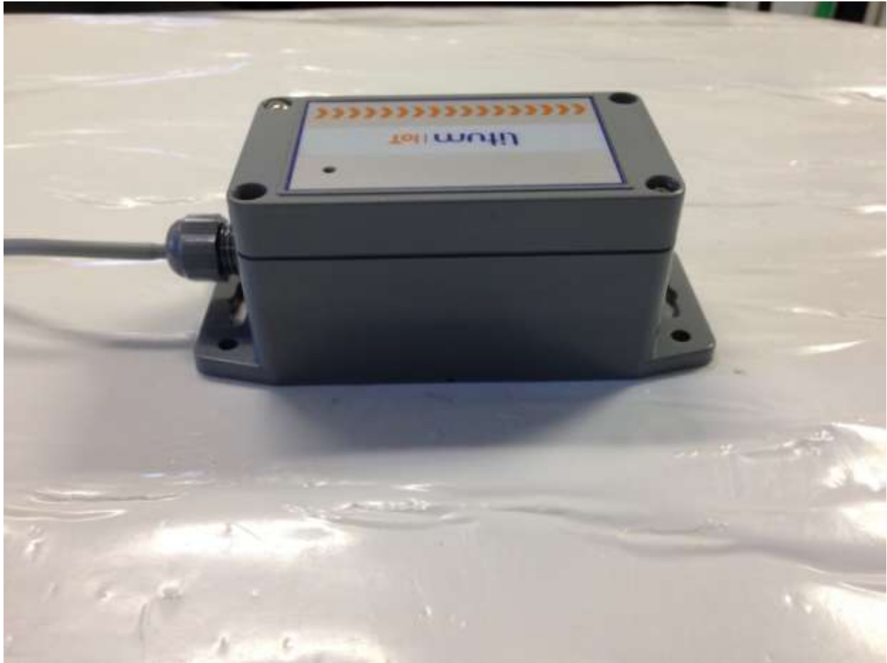
Figure 4. EUT Side View 3

FCC Part 15 Certification 2AUF1-FT-05FL 19-0287 November 5, 2019 OKYANUS TEKNOLOJİ FT-05FL