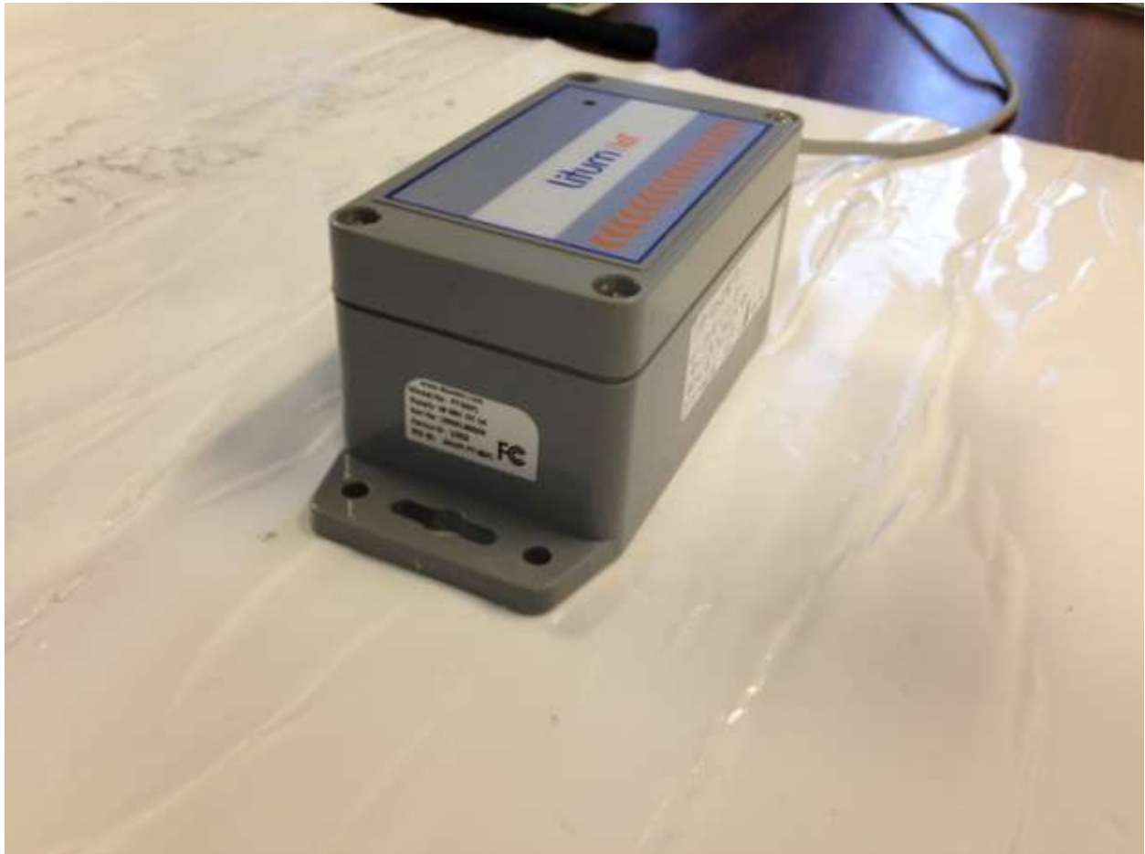
Figure 5. EUT Side View 4

FCC Part 15 Certification 2AUF1-FT-05FL 19-0287 November 5, 2019 OKYANUS TEKNOLOJI FT-05FL