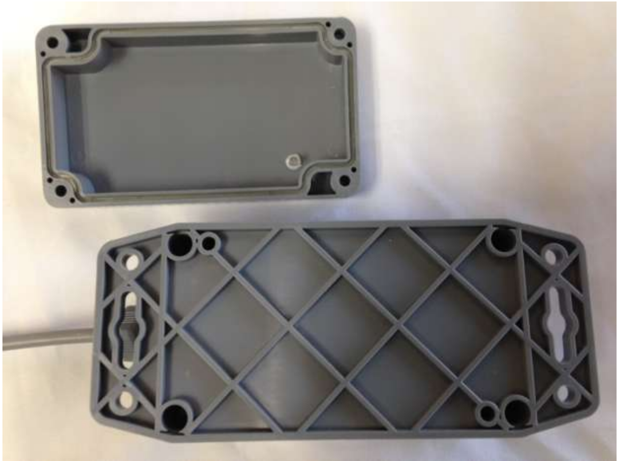
Figure 6. EUT Bottom

FCC Part 15 Certification 2AUF1-FT-05FL 19-0287 November 5, 2019 OKYANUS TEKNOLOJI FT-05FL