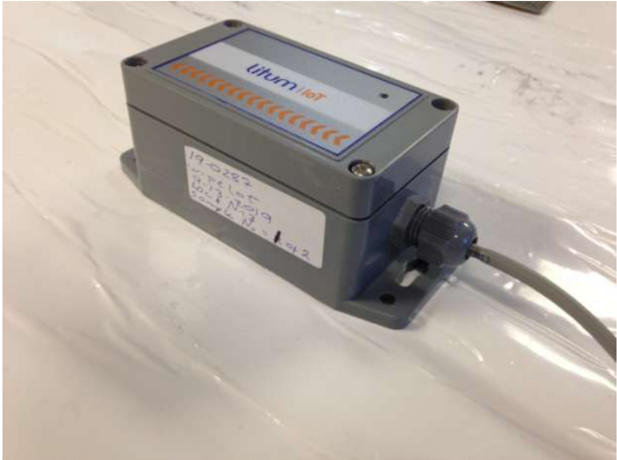
Figure 3. EUT Side View 2

FCC Part 15 Certification 2AUF1-FT-05FL 19-0287 November 5, 2019 OKYANUS TEKNOLOJİ FT-05FL