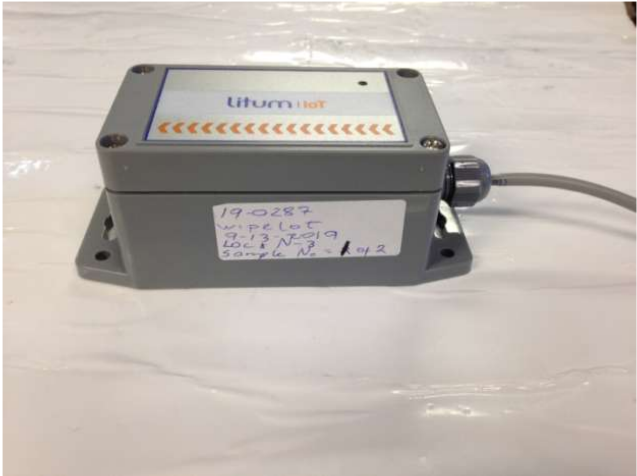
Figure 2. EUT Side View 1

FCC Part 15 Certification 2AUF1-FT-05FL 19-0287 November 5, 2019 OKYANUS TEKNOLOJI FT-05FL