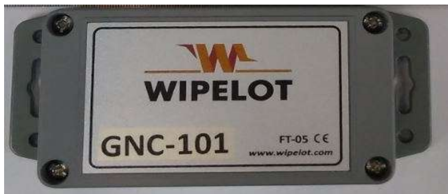
Figure 7: Wipelot FT-05FL Collision Avoidance Reader