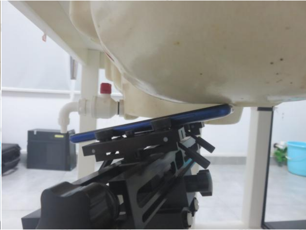
Left Tilt 15°