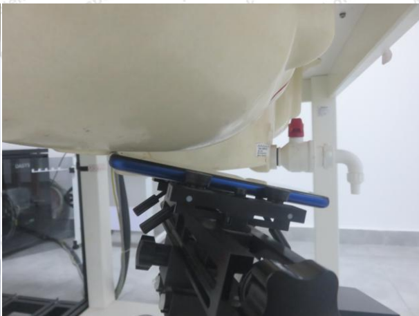
Right Tilt 15°