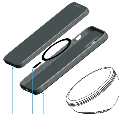
Mobile phone Magnet Phone case

This wireless charger is designed attracted-magnetically, iPhone12 series mobile phone can be attracted instantly. Please use Magsafe phone case for perfect attracting and wireless charging if you need a protective case.