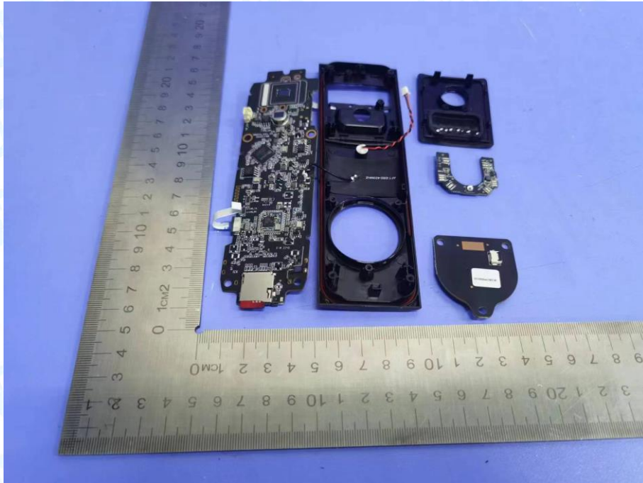
Photo 12 Appearance of PCB