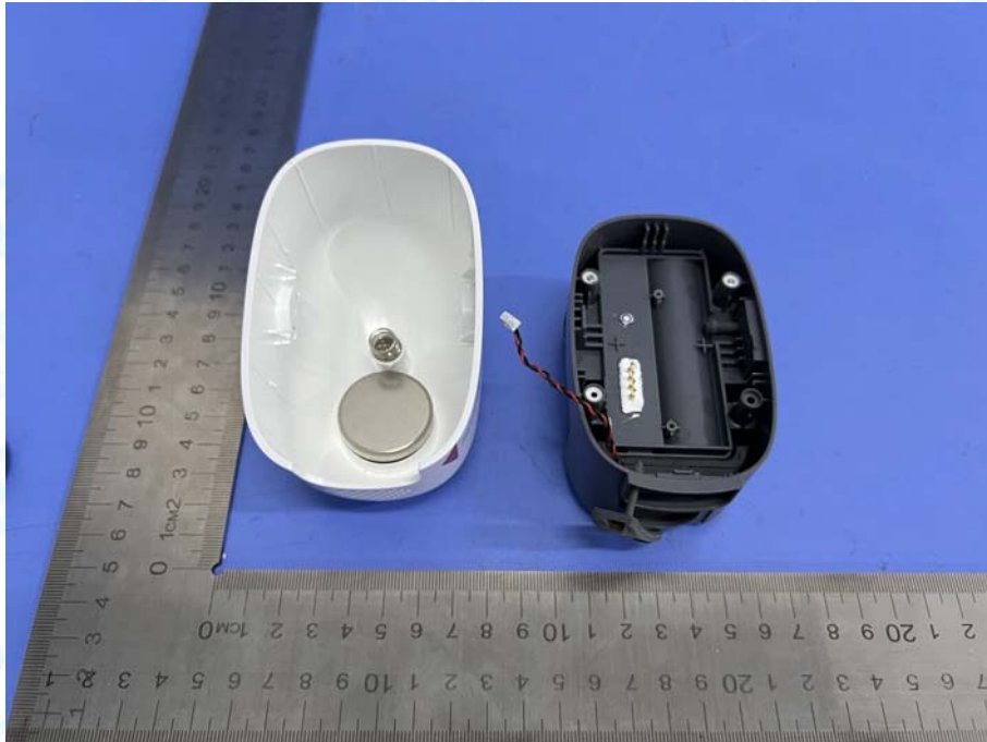
Photo 10 Appearance of Battery