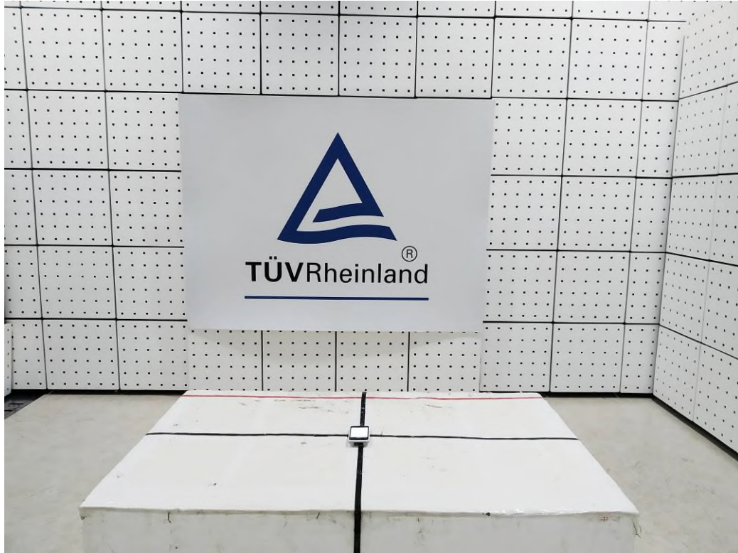
Photograph 2: Set-up for Spurious Emissions (Back View 1)