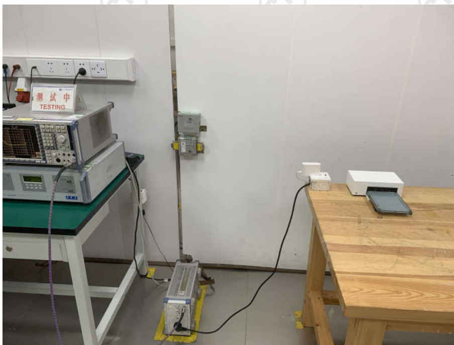
AC Power Line Conducted Emission