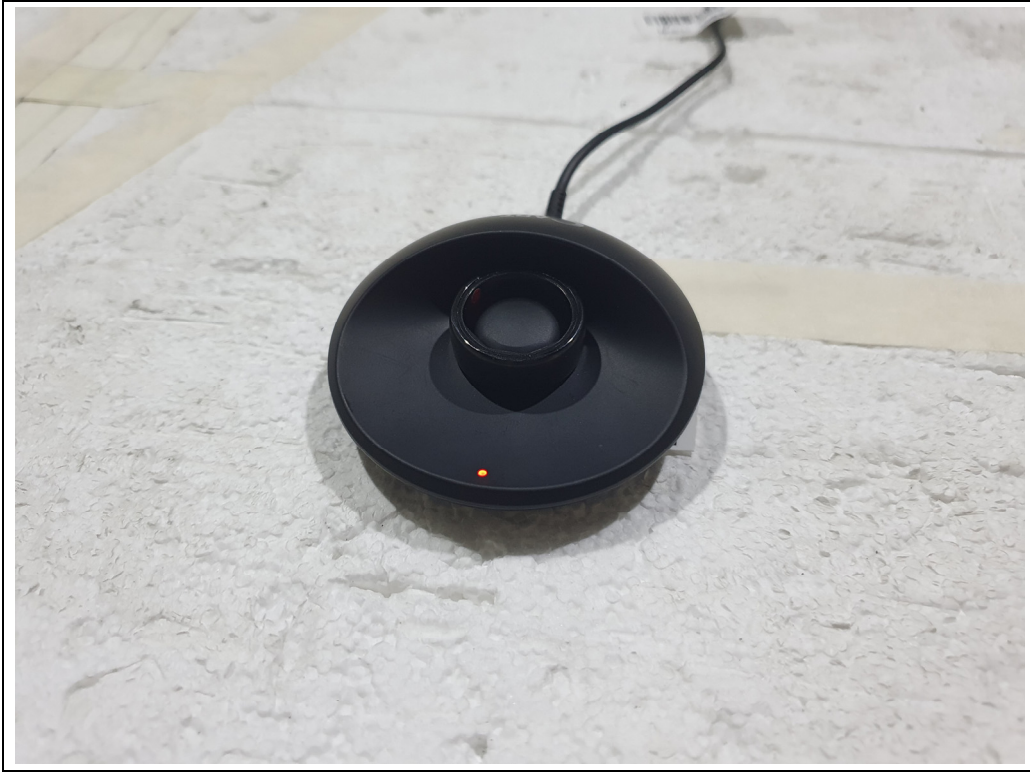
EUT Position: X-axis