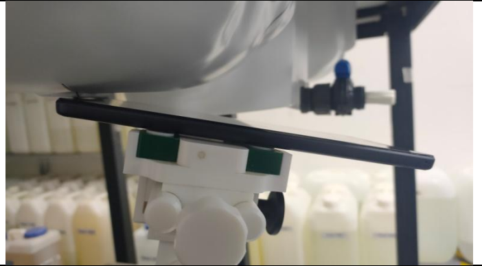
Right Tilt 15 Degree