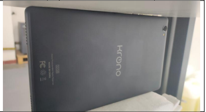
Right Side (Separation distance of 0mm)