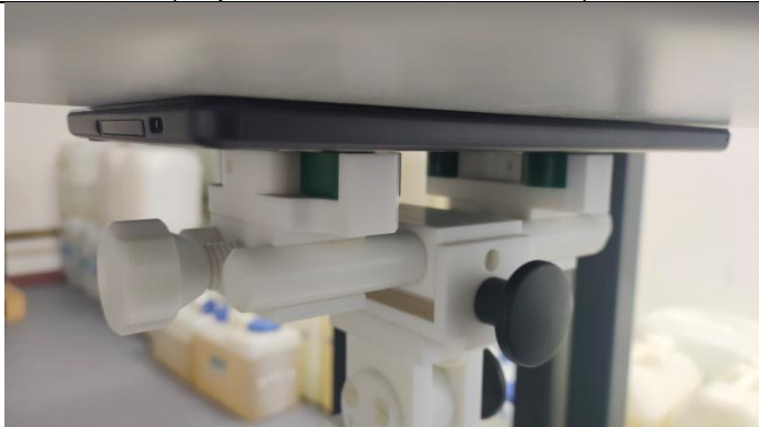
Front Side (Separation distance of 0mm)