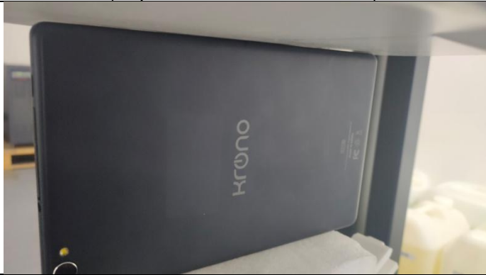
Left Side (Separation distance of 0mm)