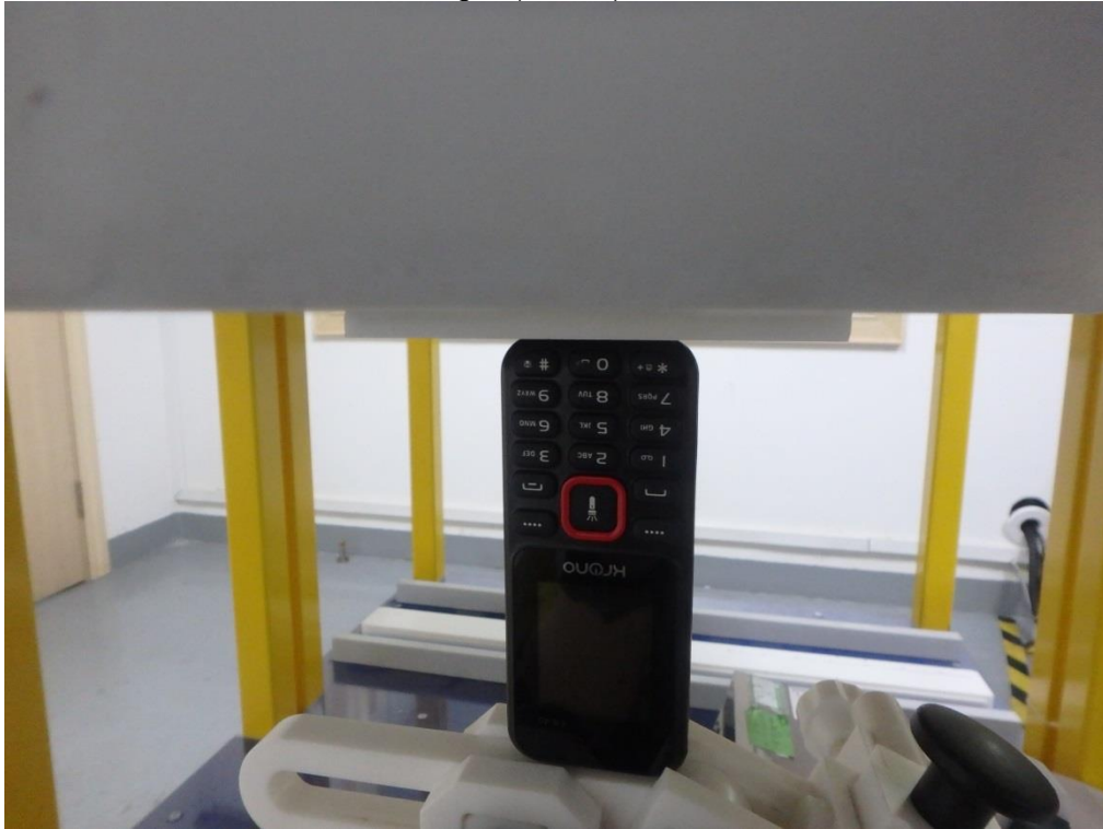
Edge 4(Left) 5mm