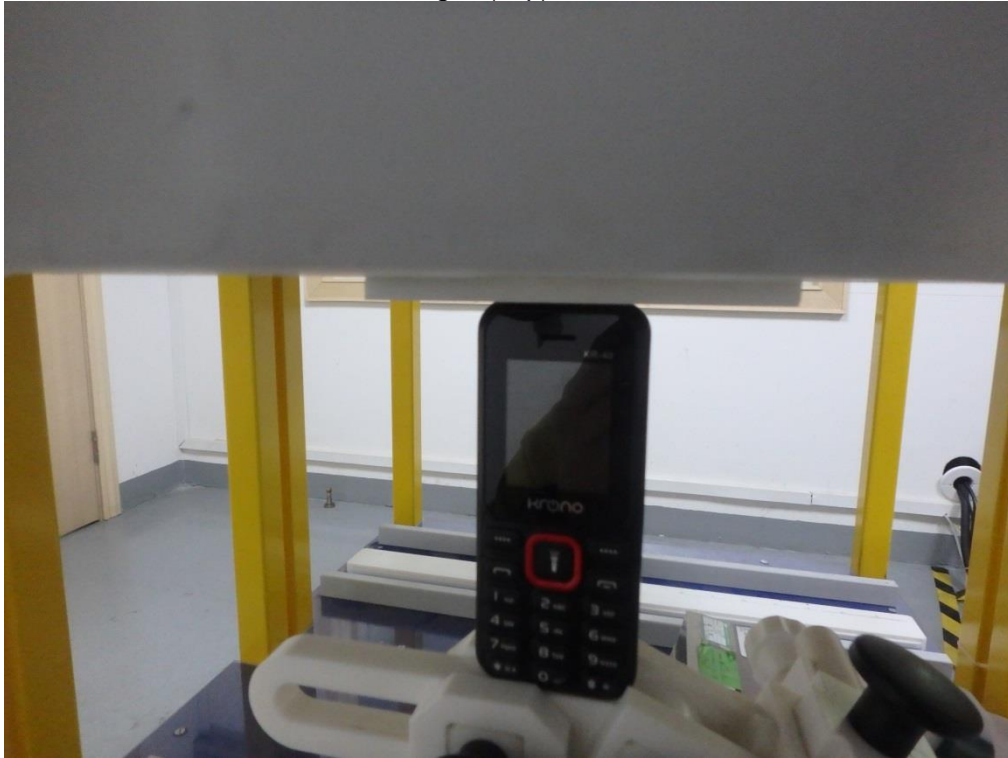
Edge 2(Right) 5mm