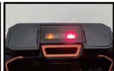
Figure 6 1D/2D scanner working status