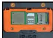
Figure 3 Lock the sim card