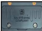
Figure 4 Close the back cover of the SIM card