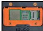
Figure 1 SIM card slot

Open the SIM cover, you will see the TFF SIM card & Micro SD card slot. Please be aware of the right slot & direction as illustration.