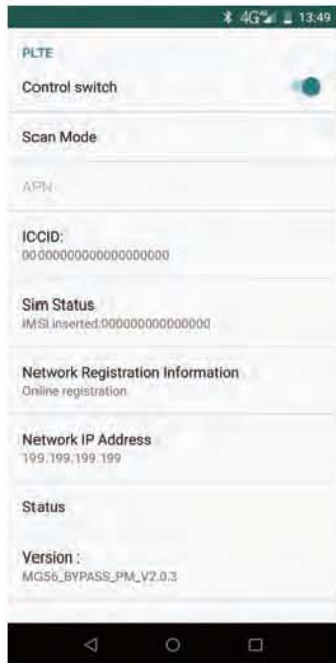
Figure 9 4G PLTE on state