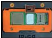
Figure 2 Put the SIM card into the card slot