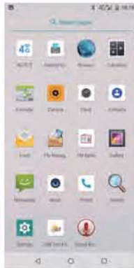
Figure 7 Application interface

Click the Settings app in the application interface to enter the settings.