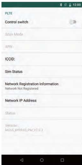
Figure 8 4G PLTE off state

Enter the PLTE APK, set PLTE module configurations in 4G interface: