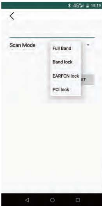
Figure 10 Scan mode page