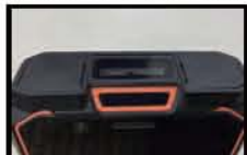
Figure 5 1D/2D scanner

Install the appropriate scanning tool APK in the handheld, open the APK, click to open the corresponding scanning function item, the 1D/2D scanner will emit a red scanning light, aim at the QR code or barcode, and the scanning tool APK will display the corresponding information.