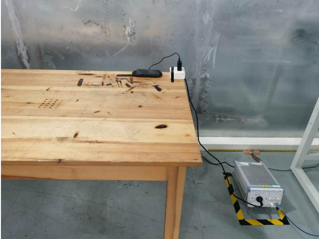
Conducted Emission-AC adapter charge mode