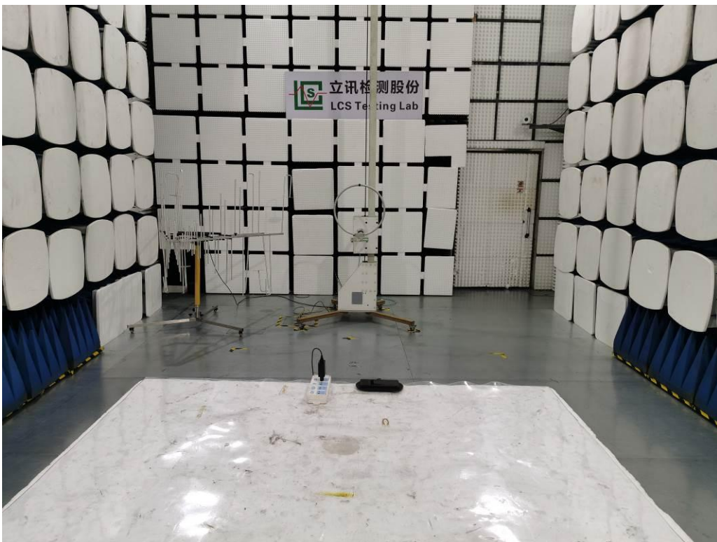
Radiated Emission below 30MHz-AC adapter charge mode