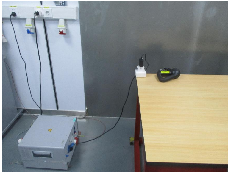
Test Setup – Conducted emission