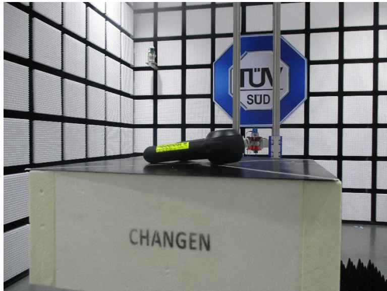
Test Setup – Spurious emissions (1000-18000 MHz)