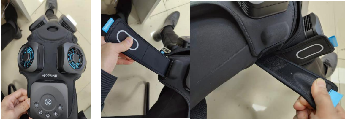
Fig. 1.1 Align knee with the central holeFig. 1.2 Strap passes through the hole buckleFig. 1.3 Stick the velcro tight

Remove the battery and cover the product around the knees as shown in Figure 1.1. The two straps are passed through the corresponding hole buckles, as shown in Figure 1.2. Then fold the strap back and tighten it, and stick the velcro tightly to complete the wearing.