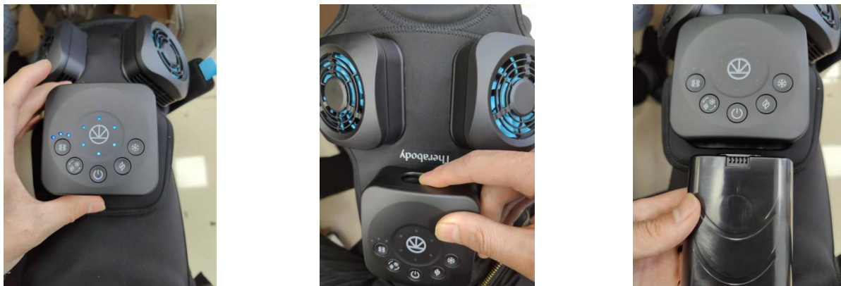
Figure 2.1 Insert the battery with the electrode facing upFigure 2.2 Power on self inspectionFigure 2.3Push out the battery

Note: In the shutdown state, install the battery immediately after the battery is removed, and it may not enter the power on self-test. Because the main control board hardly consumes power in the shutdown state, there is still residual power in the capacitance of the main board. No self inspection will not affect normal use.