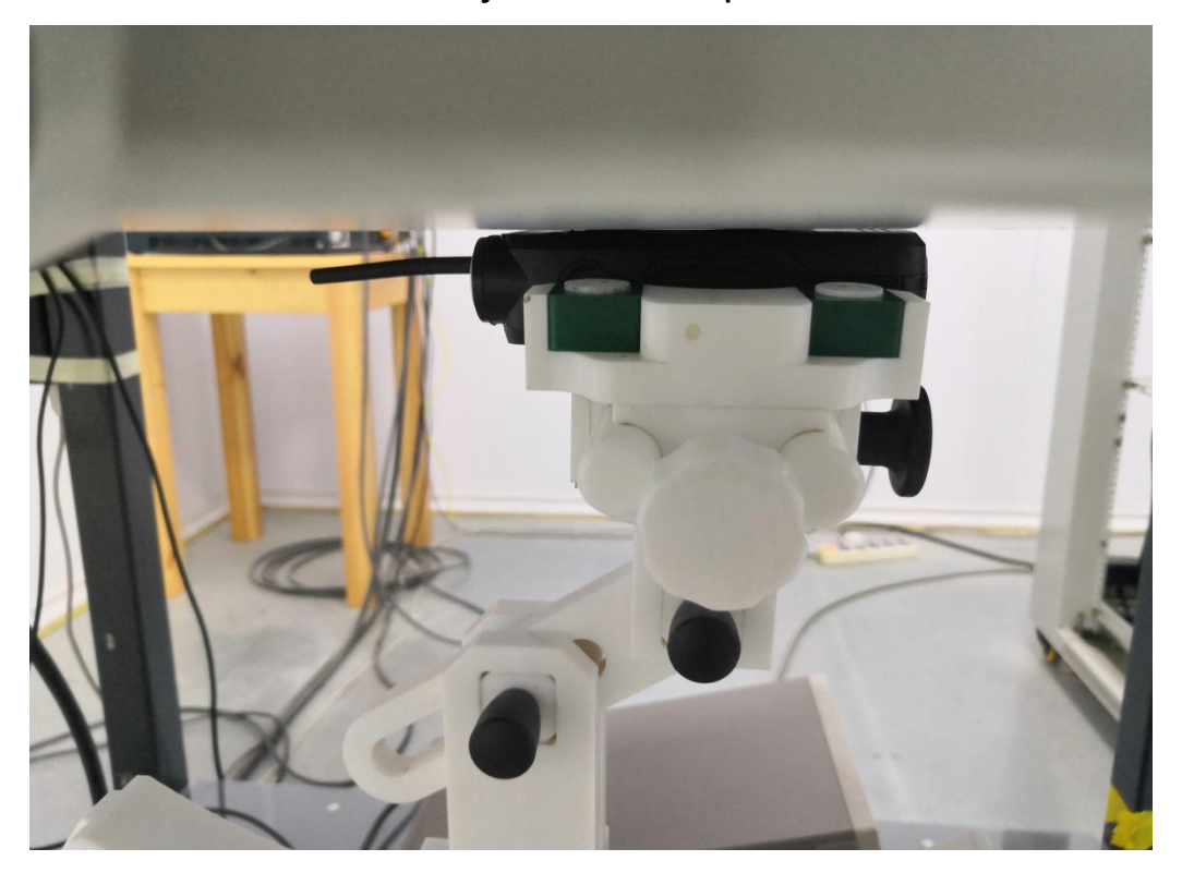
25mm Front of face Side Setup Photo