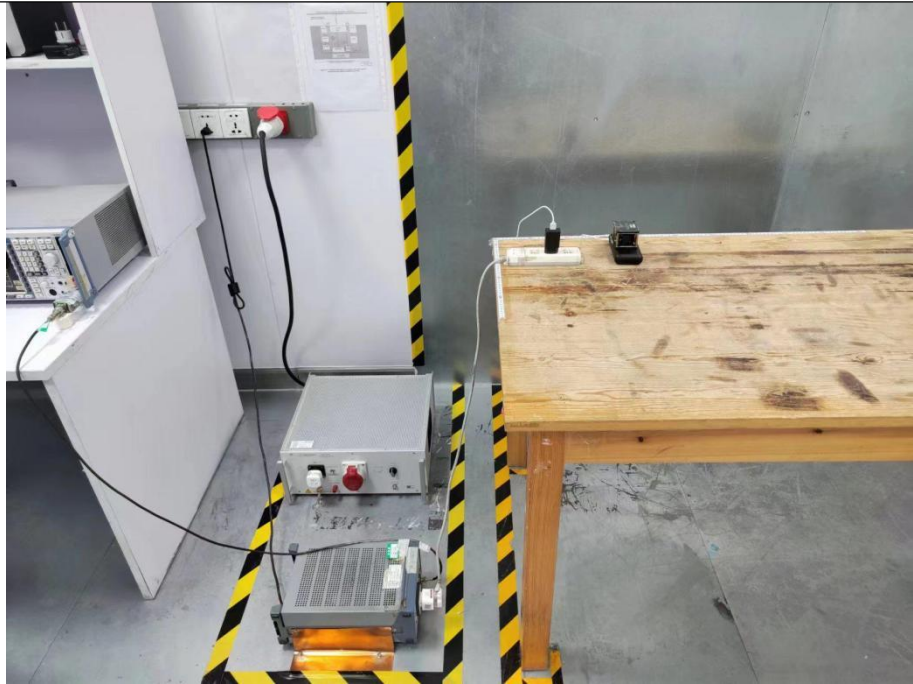
Emissions in restricted frequency bands (9KHz - 30MHz)