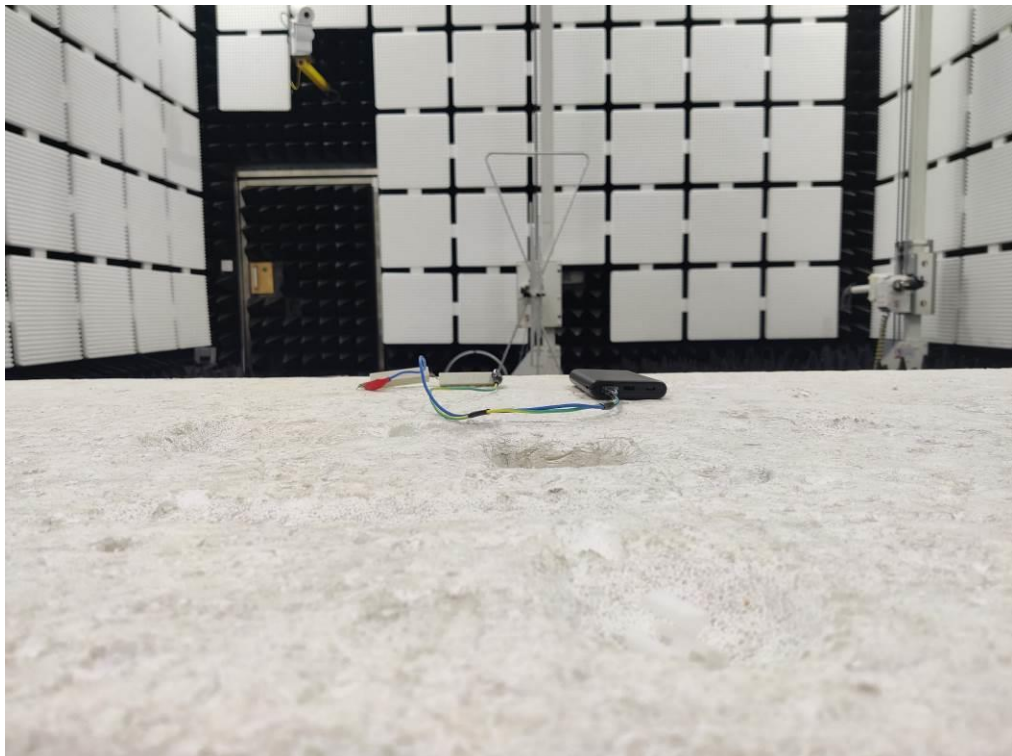
Radiated Emission Below 1 GHz