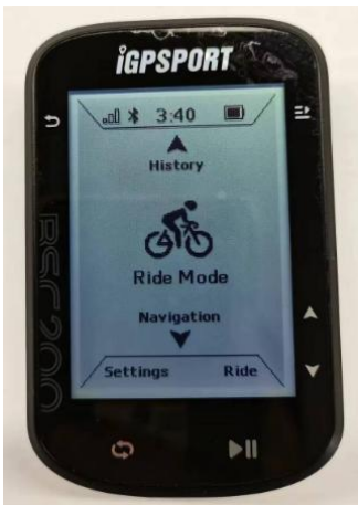
1. Choice Setting