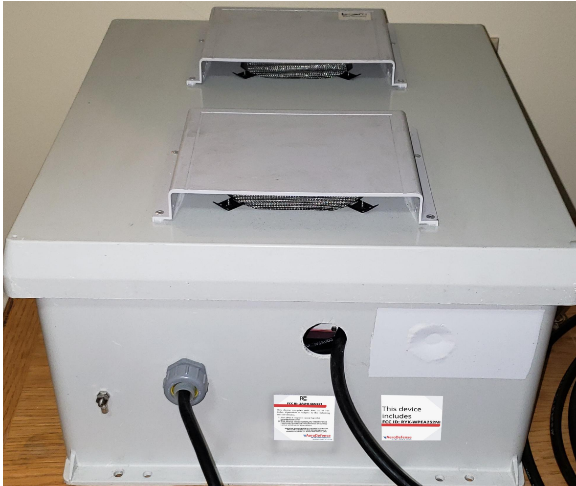
Figure 3: Labels location.

The FCC ID and the included module labels will be placed on the bottom of sensor box from outside. Please see the following figure.